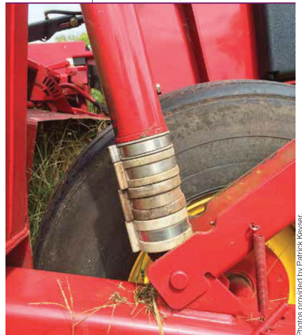
FIGURE 3 Stroke-limiting collars installed on mower-conditioner lift cylinders can be used to raise cutterbar height

The first method for achieving higher cutting heights is through the use of stroke-limiting