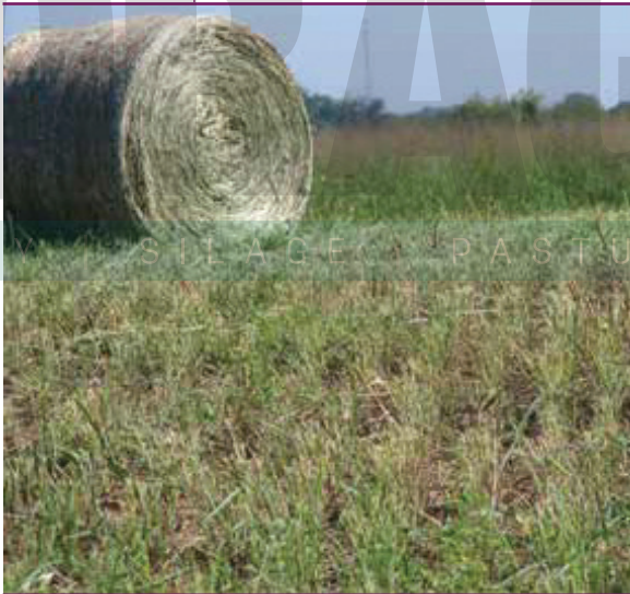
FIGURE 1 Stubble left following an Alamo switchgrass hay harvest